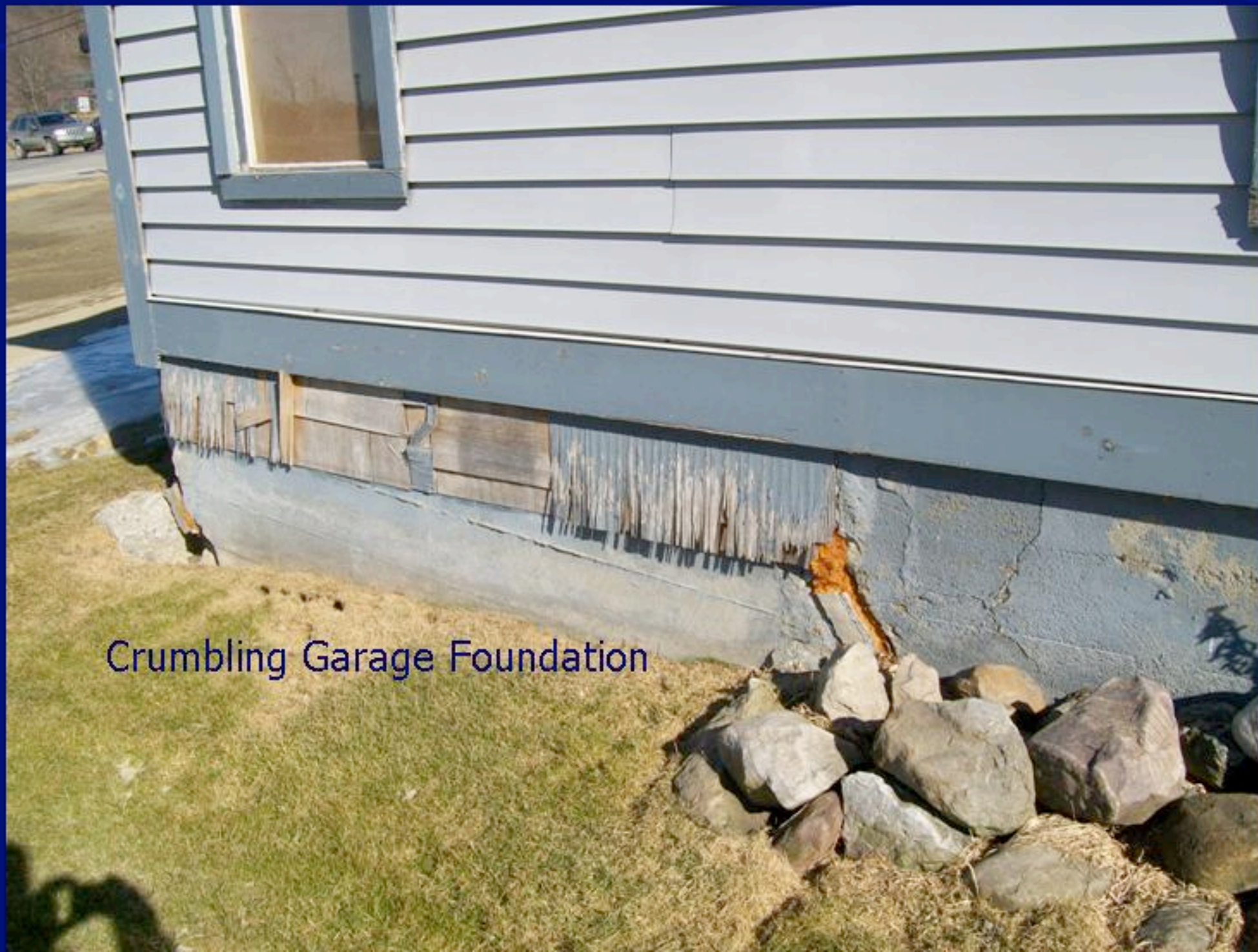
Crumbling Garage Foundation