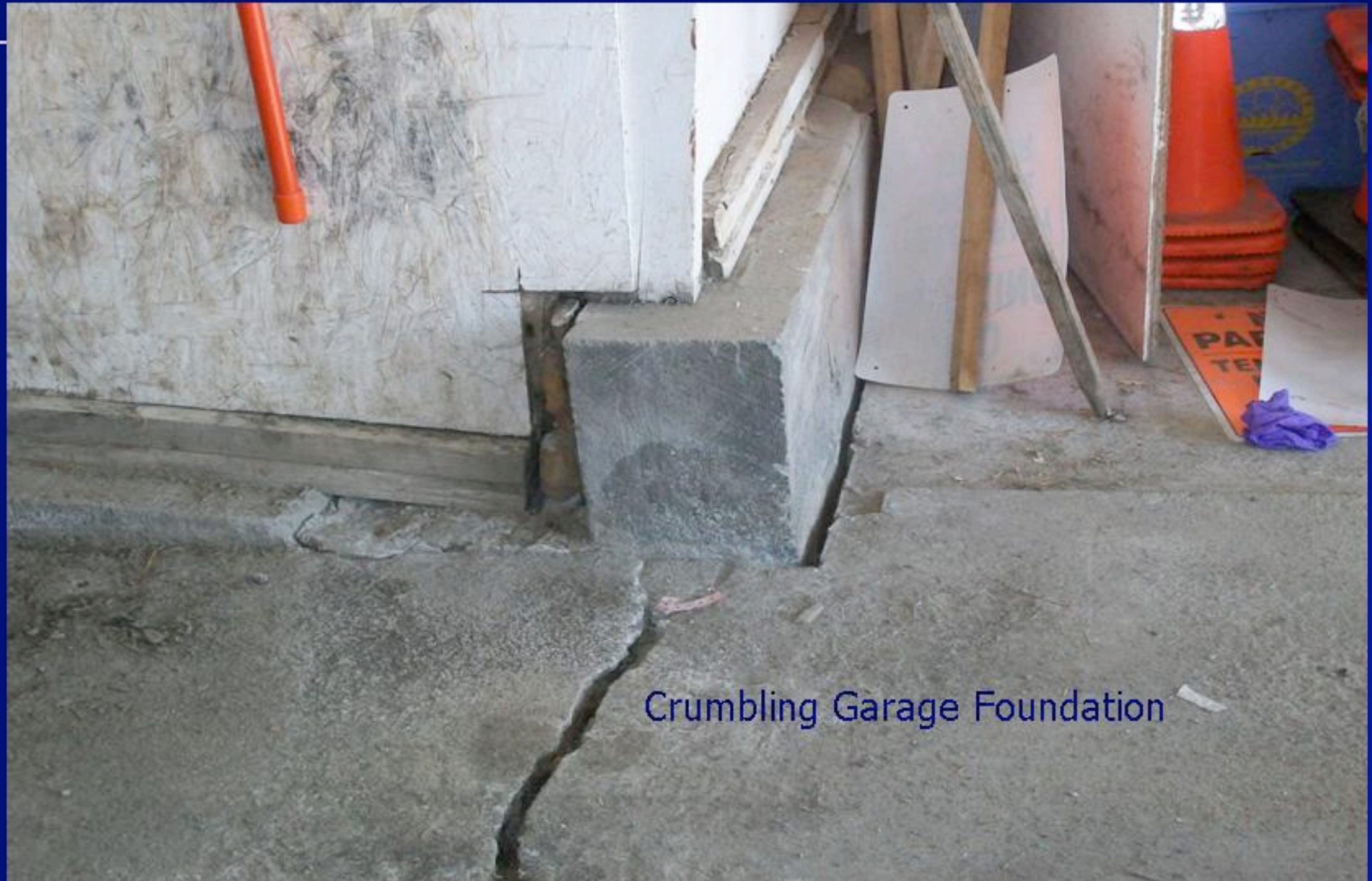
Crumbling Garage Foundation