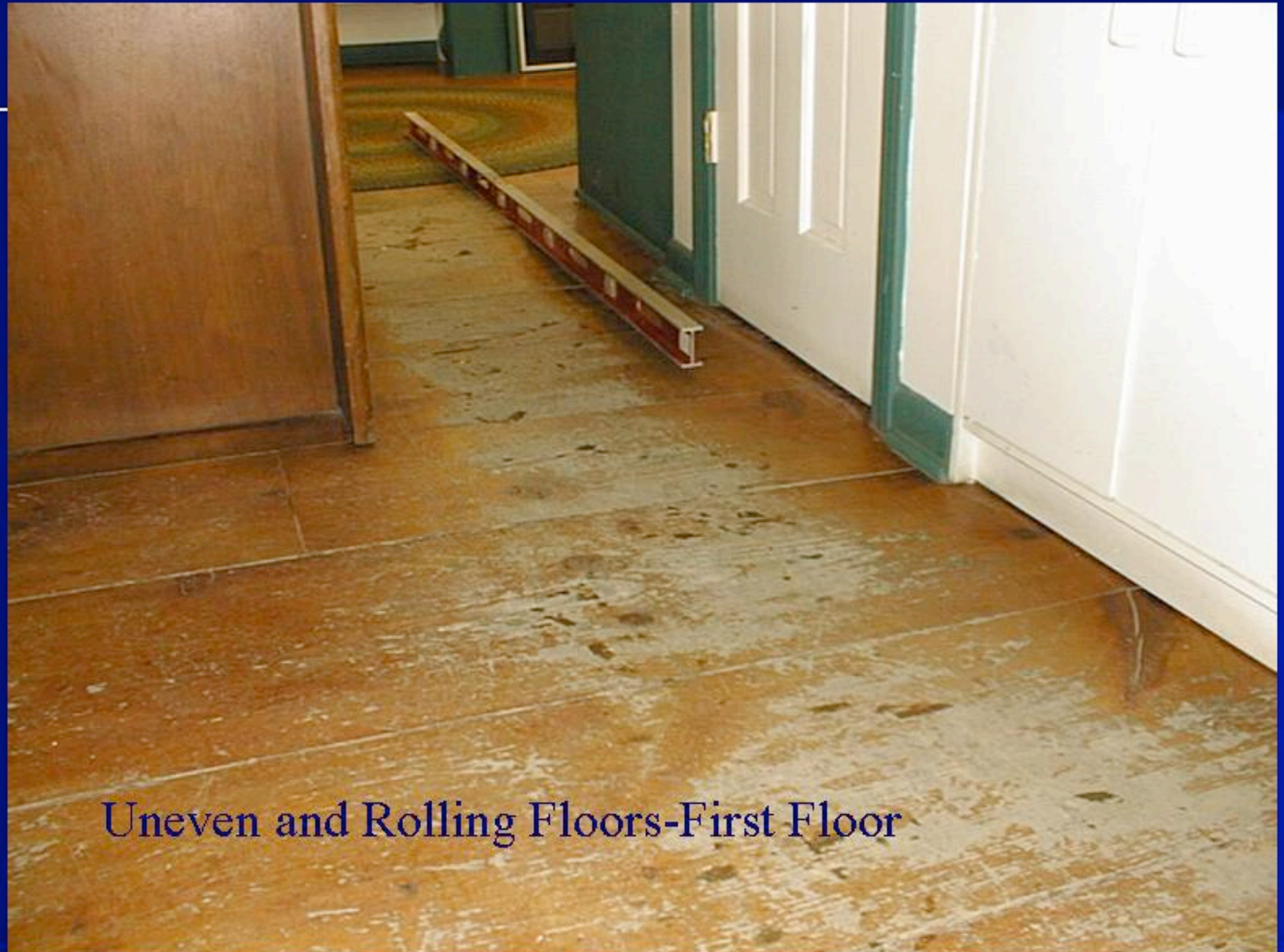
Uneven and Rolling Floors-First Floor