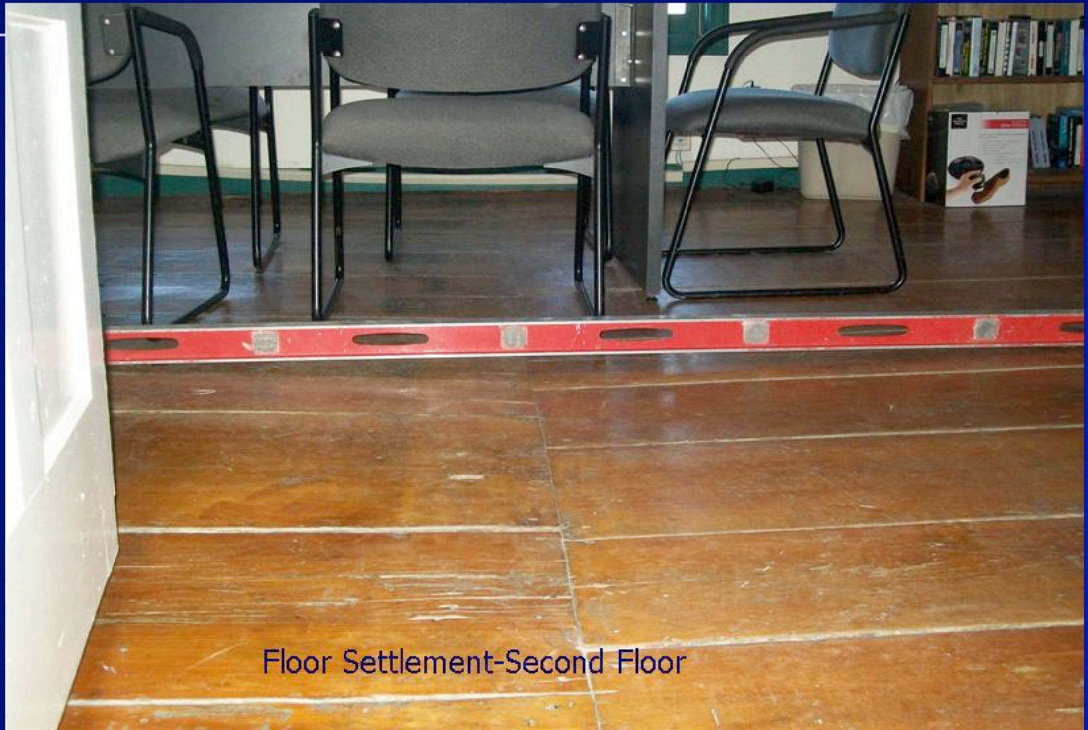
Floor Settlement-Second Floor