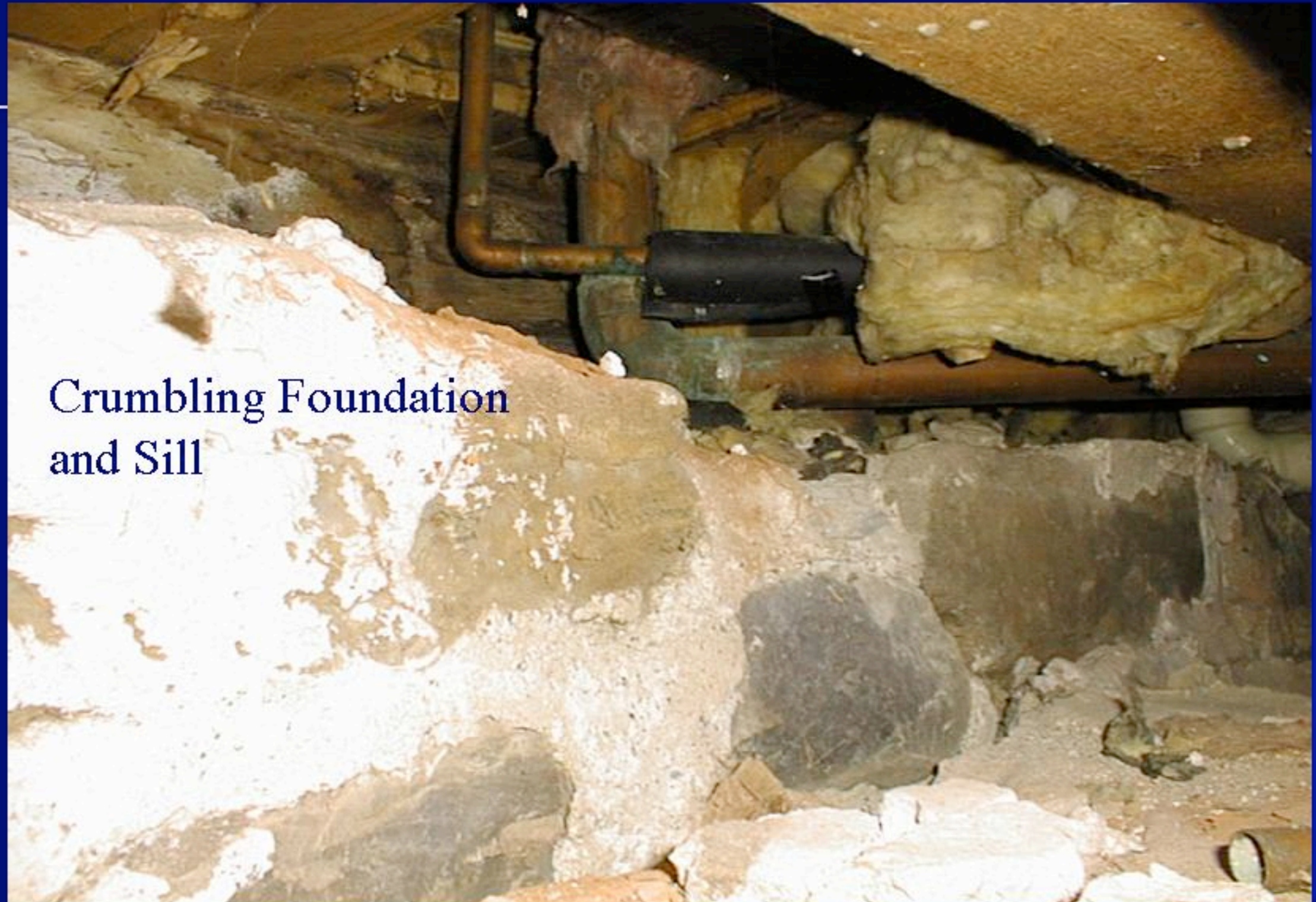
Crumbling Foundation and Sill