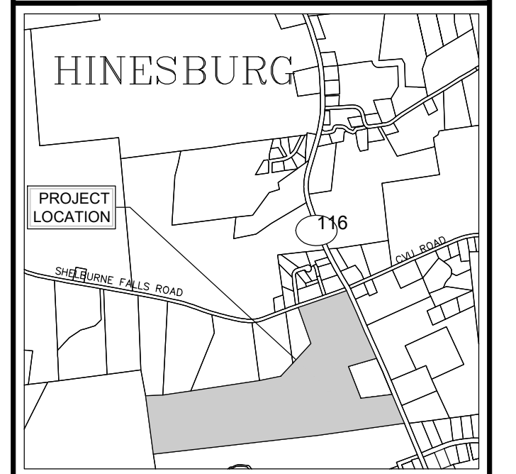
LOCATION MAP 1" = 2000'