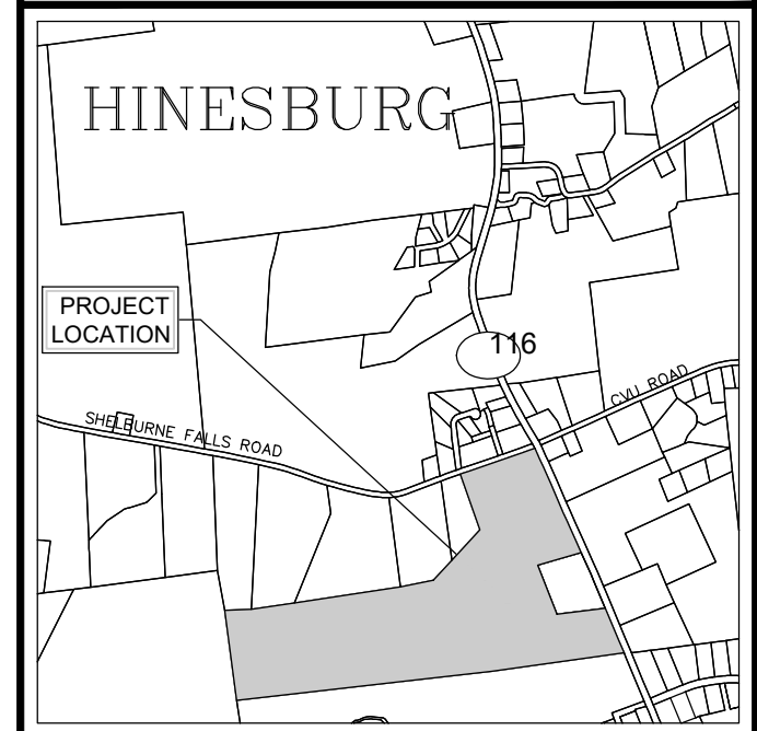
LOCATION MAP 1" = 2000'

SHELburnE FALLS ROAD VERMONT ROUTE 116 HINESBURG, VERMONT 05461